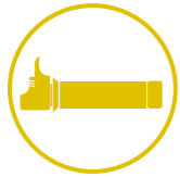
CHAPTER 4 GRIPS | THROTTLE PAGE 97 - 120