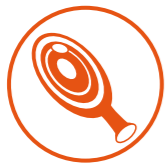
CHAPTER 1 INDICATORS PAGE 1 - 50