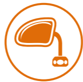
CHAPTER 3 MIRRORS PAGE 75 - 96