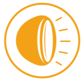
CHAPTER 2 TAIL & HEAD LIGHTS PAGE 51 - 74